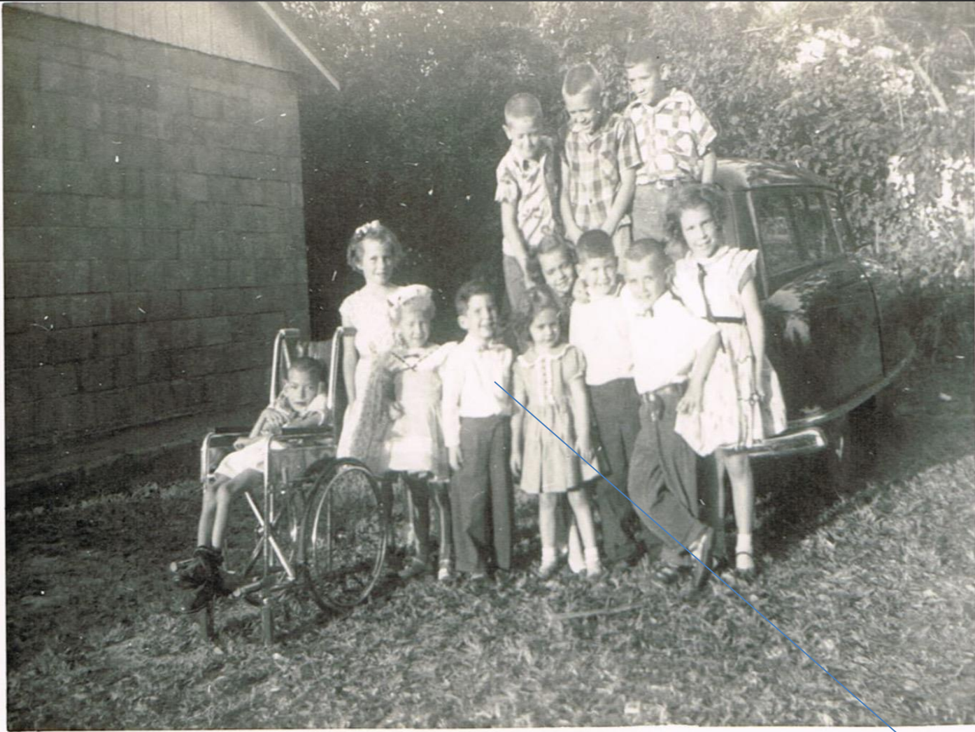
Group of children on Sunday morning