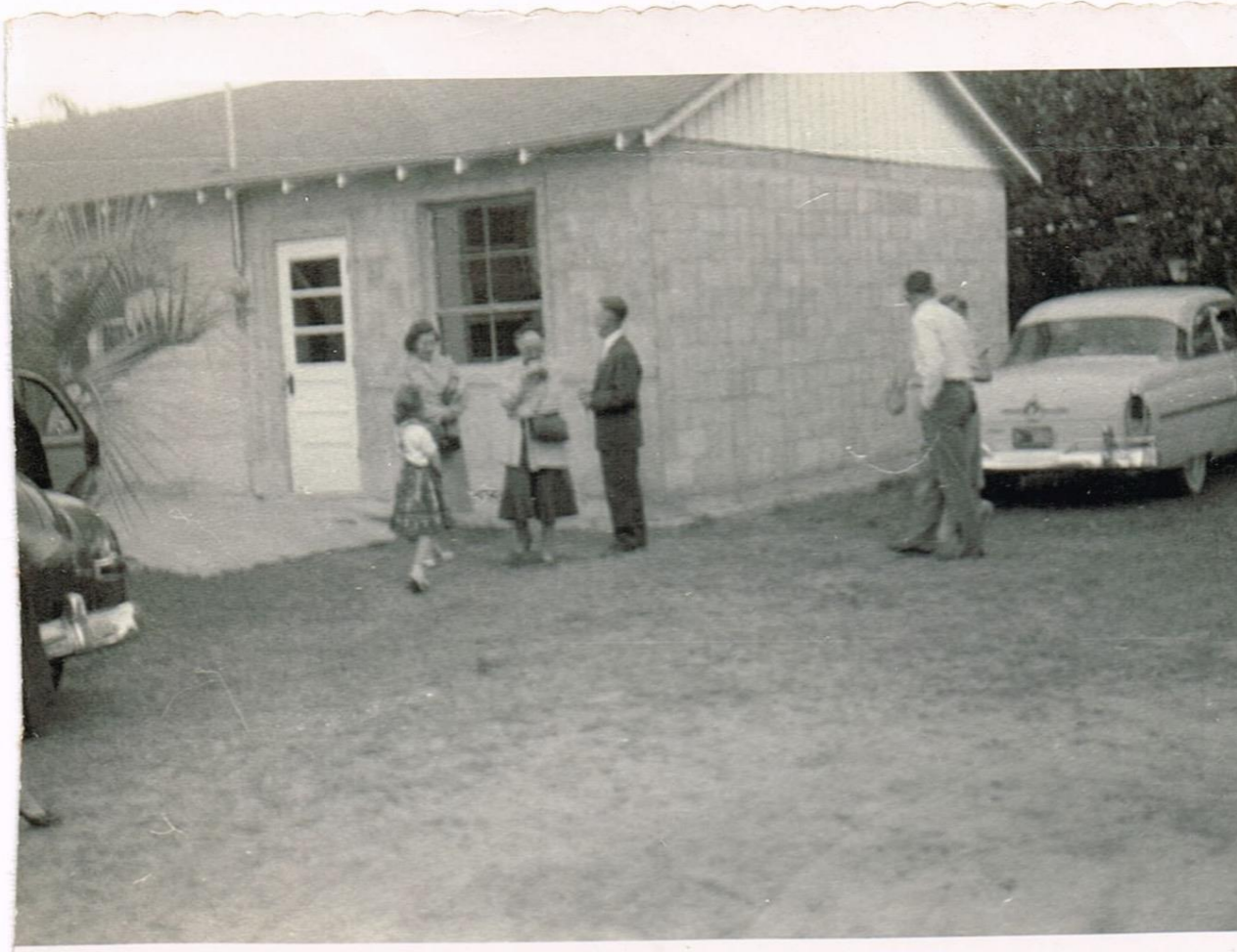
The classroom building was used for services until the auditorium was finished.