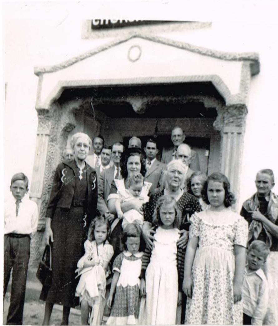
Group of members on Sunday Morning