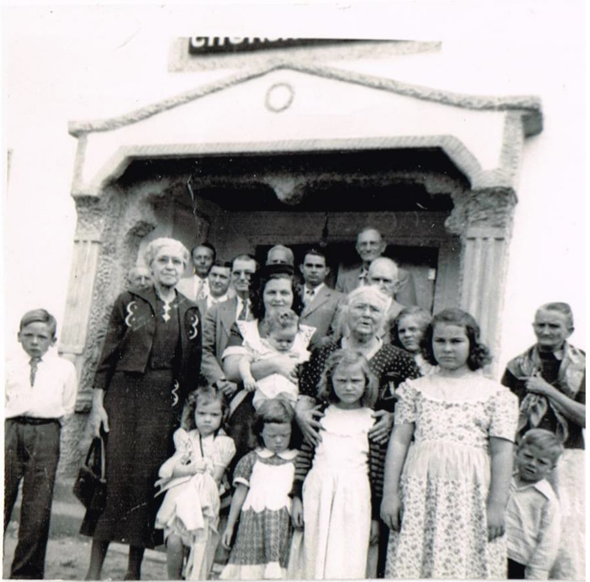
Group of members on Sunday morning