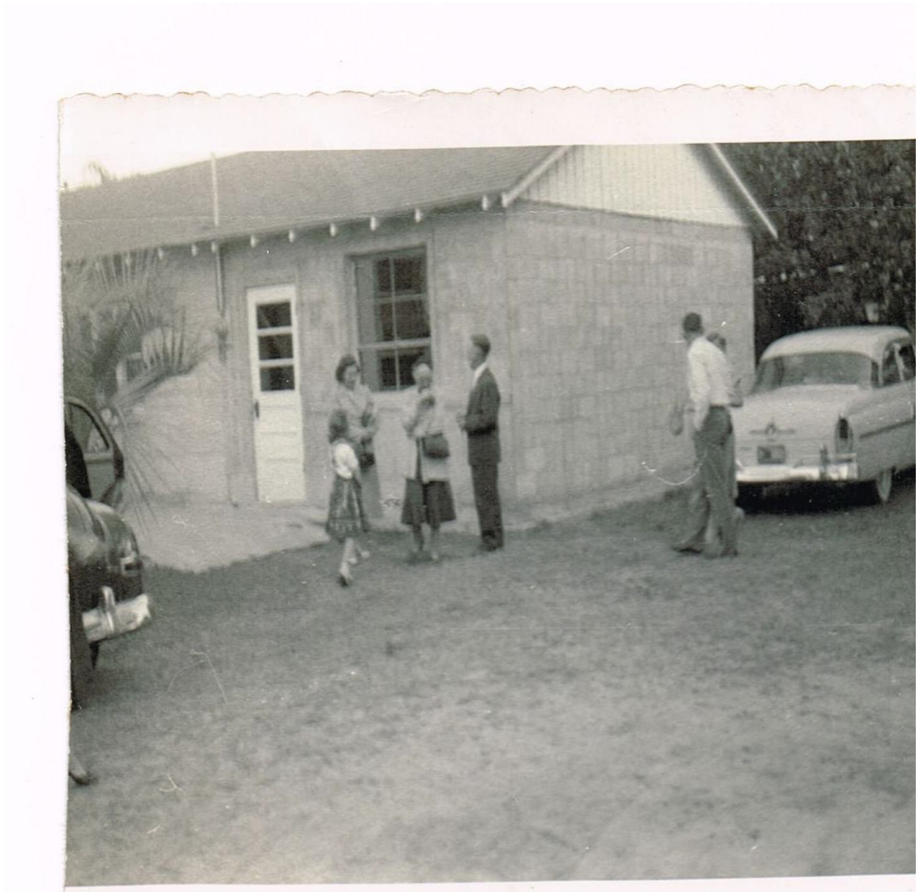
Classroom building being used for services until the auditorium is finished.