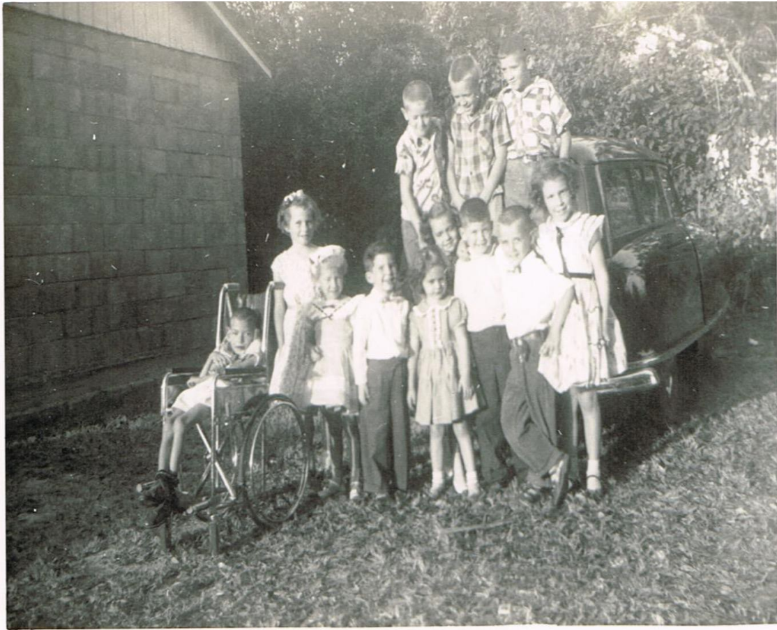
Group of children on Sunday morning: